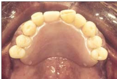
Fig 3 Gum stripper