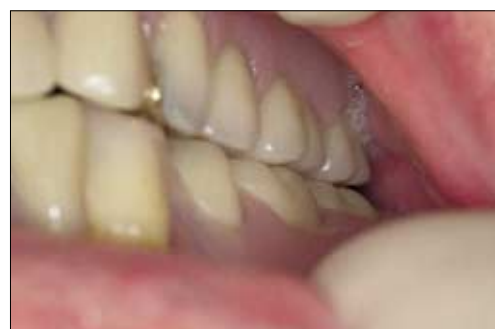
Fig 6 Lack of occlusion after 6 months

For many patients, a simple occlusal prescription is all that will be required, ie the patient has 'evolved' to using essentially vertical mandibular movements with little or no lateral and protrusive mandibular movements.