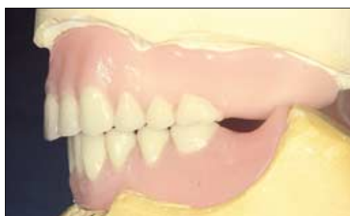
Fig 9a F/F with compensating curves