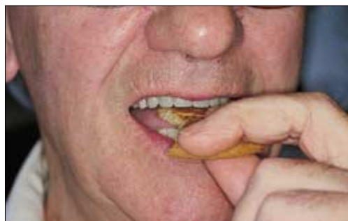
Fig 10 Diagnostic biscuit

If the re-organised approach is to be used; the next question is whether there is a need for a pre-treatment phase of splint therapy. If so, copies of the patient's old dentures will be converted into splints that can be used to establish a new jaw relationship (vertical, horizontal or antero-posteriorly).