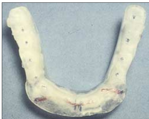
Fig 1 Occlusal diagnostic appliance (stabilisation splint)