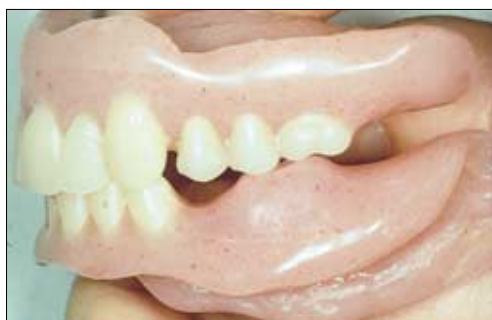
Fig 12 Registering CR with a pivotal appliance

The occlusion of the dentures that will be 'ideal' for the patient is the one which will limit the tilting of the dentures and so minimise disruption to the peripheral seal, risking instability. As stated this occlusal prescription will take into account the patient's denture bearing tissues and their chewing pattern.