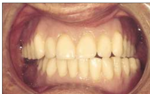
Fig 7a Unilateral premature