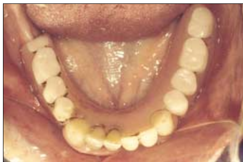
Fig 4 Training denture

ing dentures (Fig. 4) are sensible treatment options when the state of total edentulousness is deemed to be unavoidable.