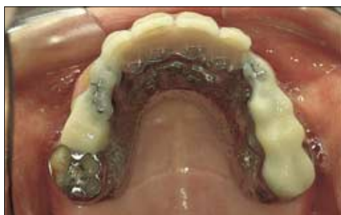
Fig 2 Hybrid prosthesis

sion, sometimes at a raised occlusal vertical dimension. If a partial denture is tooth supported then the design of the occlusion provided by that prosthesis should be to 'conform' with and be complementary to the existing occlusion. The only exceptions to this would be 'rehabilitative' prostheses, which are occlusal diagnostic splints (Fig. 1) and hybrid prostheses (essentially overdentures) (Fig. 2). The difference between the two is that the splint is not intended to be definitive whereas the hybrid prosthesis is. Conventional wisdom indicates that the dentist must determine the patient's ability to withstand a raised occlusal vertical dimension with a temporary (diagnostic) prosthesis prior to prescribing the definitive denture/prosthesis.