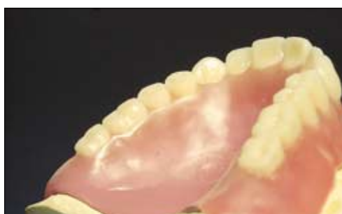
Fig 9b F/F with compensating curves

which might compromise this stability are illustrated in Figure 7. They are: