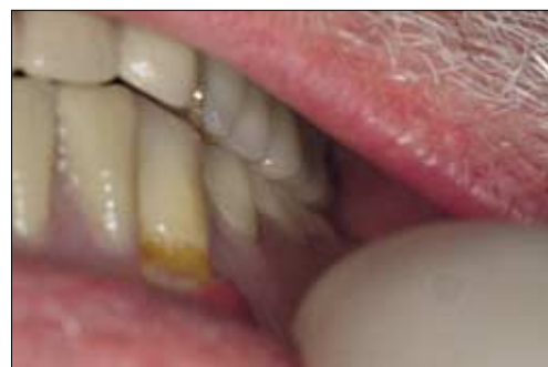
Fig 5 Occlusion at insertion

The minimal level of occlusion that any practitioner should prescribe in complete dentures is balanced occlusion ; this is described by the British Society for the Study of Prosthetic Dentistry 5 as 'even, harmonious bilateral contact between teeth or tooth analogues in retruded contact position (RCP)'. In our terminology this means a 'balanced centric occlusion in centric relation' (CO = CR). This is a 'static occlusion' concept and this type of an occlusion would ensure that, as a patient elevated the mandible into CR, the dentition would be stable. There would be no tilting/displacing force on the dentures and so stability would not be compromised. Factors