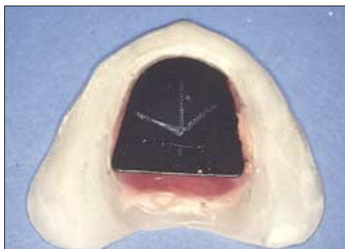
Fig 11b Gothic arc trace arrowhead

new occlusal vertical dimension (OVD) and to provide occlusal stability. When all adjustments have been made and the patient has been wearing the appliance comfortably for a period, it is a simple procedure to register centric relation with a registration material placed before and behind the pivots. Pivotal appliances may be made on acrylic bases, or from the patient's previous dentures. It may be wise to make a copy of the patient's denture with which to make the pivotal appliance. It will then be possible to return the original denture intact to the patient.