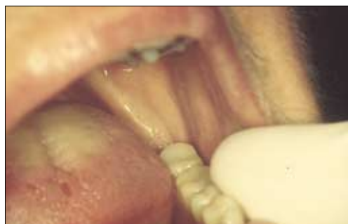
Fig 7c Injudicious placement of teeth