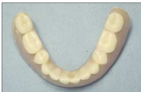
Fig 7b Too large an occlusal table