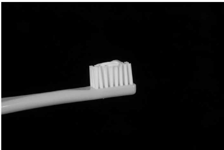
Figure 1: Smear of toothpaste (approximately 0.1 ml) representing the recommended volume for children under the age of three years

Brushing with a smear of 1,000 ppmF toothpaste involves 0.1 \text{ ml} \times 1 \text{ mg F/g} = 0.1 \text{ mg F} .